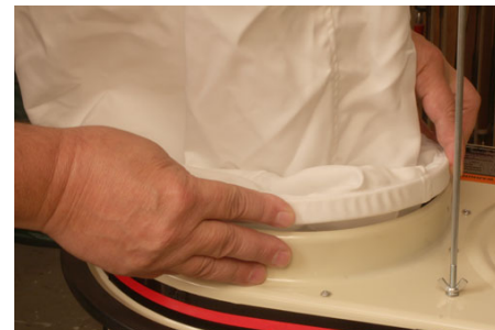
Both the upper filter and lower catch bags are retained with a sewn-in, spring steel ring that makes their removal or installation quick and tool free.

The JET DC-500 Dust Collector comes with a fabric catch bag with a 1.9 cubic foot capacity. The catch bag has a clear "window" that lets you see when it is time to empty it. The upper filter bag retains particles down to 30 microns in diameter. Both bags are retained in the main housing by