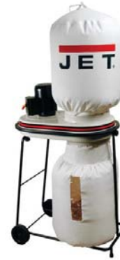
The JET DC-500 Dust Collector brings the power you need in a durable and compact package.

Effective dust collection is important in the confined environment of small to mid-sized woodworking shops. Benchtop and mid-sized floor model woodworking machines require effective dust and chip evacuation to maintain their effectiveness. The JET DC-500 Dust Collector, though compact in physical size has been designed to keep your machines clear and your shop cleaner. Even the initial assembly is simple and completely tool free!