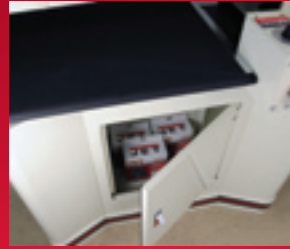
Built-in cabinet door for easy access to storage