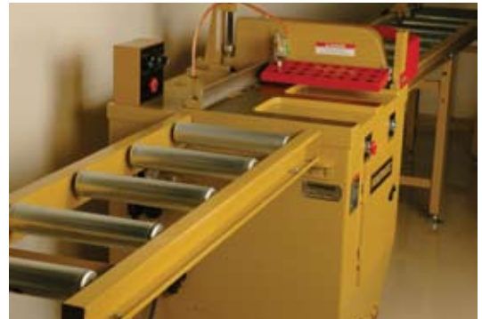
Large cast iron table with easy to access controls