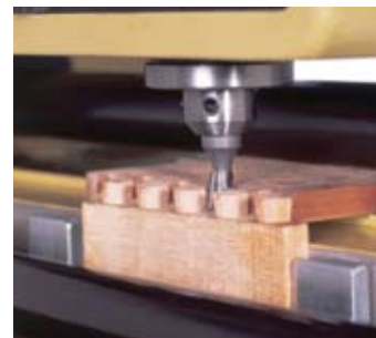
Cutter height can be adjusted from 3/16" to 3/4"