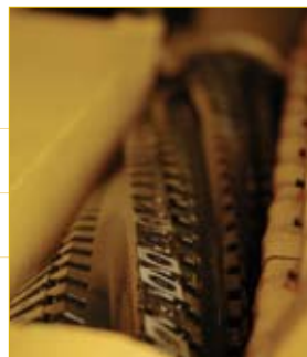
True helical cutterhead with 150 individual cutters