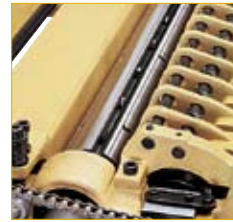
4 knife cutterhead, sectional chip breaker, and infeed/outfeed rollers