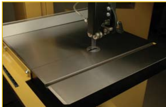
Large heavy-duty cast iron table with more work area in front of blade