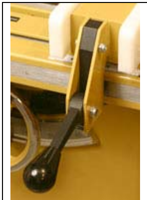
The locking handle and mechanism are simple, tough and very easy to operate.

The T-square portion of the Accu-Fence is made from heavy-gauge steel and is precisely welded to the main tube. Easy to use adjusters allow fine-tuning Accu-Fence square to the table surface (vertically) and parallel to the miter slots.