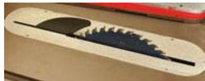
(Left) Standard and thin kerf splitters and low profile riving knives (Right) are available, all with beveled leading edges.

kickbacks, one of the more common and most dangerous forms of this accident. If the wood is allowed to rotate into the spinning blade, the speed at which it can be snatched across the blade and ejected can drag your hand into harms way. Used correctly, the riving knife system goes a long way toward preventing these types of accidents.