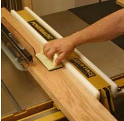
The Powermatic Accu-Fence takes t-square fence systems to a new level of accuracy.