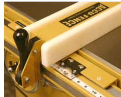
A heavy steel T-square is welded to the main fence tube and includes adjusters and a magnified cursor over the easy to read scale.

In place of the common laminate-covered wood, the POWERMATIC Accu-Fence has a pair of \frac{3}{4} "-thick HDPE (high density polyethylene) slabs that are both very rigid and have exceptional lubricity properties that allows wood to slide along them easily and predictably. The faces can be adjusted vertically to either ride just above the table or flush with the surface, whichever is safest for the material being cut. Oversized access holes along the underside of the Accu-Fence make reaching the fasteners to remove or reposition the HDPE faces much easier.